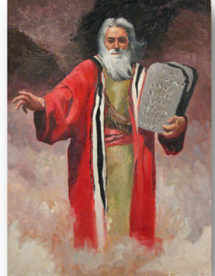
Was Muhammad like Moses? Or the greater question is did Muhammad fill ALL the prophecies of the one "like unto me" to follow Moses?

References: 1 Goldmann, Islam and the Bible ; Moody Publishers, Chicago. p.144.