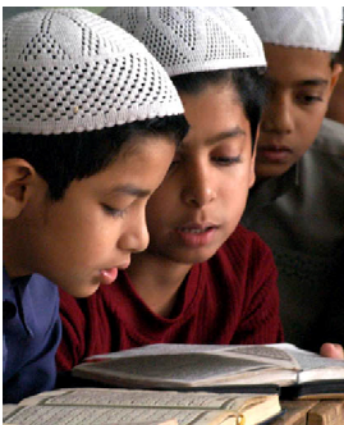
Muslim boys in India memorizing the Qur'an in a Madrasah – an Islamic religious school. Many memorize the entire Qur'an!

Some of the largest Muslim people groups in India include the Bengalis, the Biharis, Jat, Pathan, Julaha, Shaikh, Rajput, Kashmiri, Ansari and the Labbais.