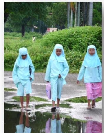
While in Indonesia last month we happened across these three Muslim girls walking home from school. Who will teach them "Jesus loves me?"

Yet the Church, by and large, is not reaching out to their Muslim neighbors with the Good News of Jesus Christ. We returned from there just last month having surveyed 100 church leaders from almost 1 dozen denominations. What did